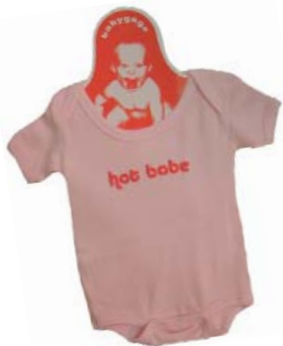
Hot Babe Onesie from Babygags

★ This is also a wonderful and easy way to help support our programs. To get started, visit our newly designed website at www.hollywoodmuseum.com . You can make a difference!