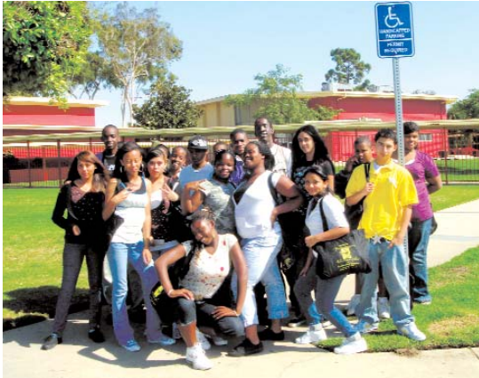
Students of Morningside High School's After School Film Academy

In September, students from Morningside High School kicked off another year of the After School Film Academy. This program, funded by the California Department of Education's 21st Century High School After School Safety and Enrichment for Teens (ASSETs) Program, has doubled in size and is still growing with 65 students enrolled in four classes.