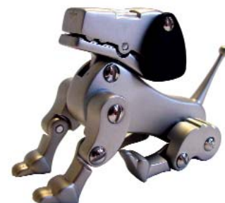
Robo Dog Desk Pet from Made By Humans