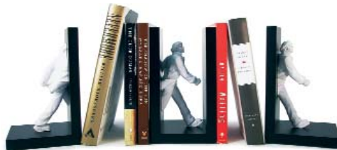
Book Ends from Made By Humans